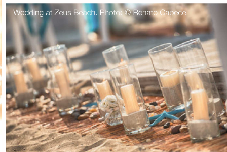
Wedding at Zeus Beach.