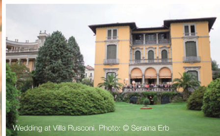
Wedding at Villa Rusconi.