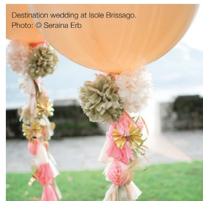
Destination wedding at Isole Brissago.